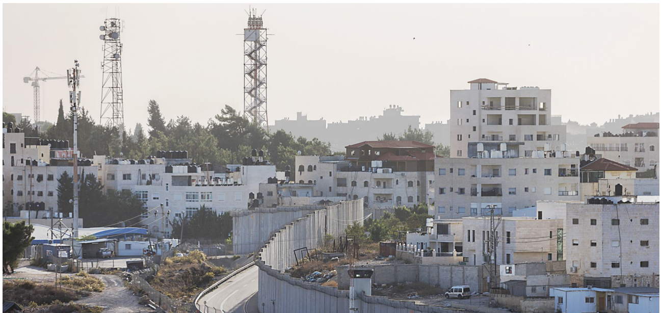
A photo taken on Nov. 4, 2023, shows a wall dividing the West Bank (right) from Israeli settlements (left) in Al-Ram, West Bank.

A little over a month into the Hamas-Israel war and a bit over two weeks since major Israeli combat operations began in the Gaza Strip, postwar governance for the territory is top of mind. While figuring out a viable plan is a necessary step in ending the current conflict and preventing the reemergence of Hamas or another group, anything resembling sustainable peace will require a future plan for the other Palestinian territory: the West Bank. In many respects, the West Bank is a far more complex puzzle, given that it is populated by both Palestinians and Israeli settlers (and a continual Israeli military presence), has a population (combining both Palestinians and Israelis) that is at least one-third larger than Gaza's, encompasses a territory that is vastly larger than Gaza, and borders (or comprises,