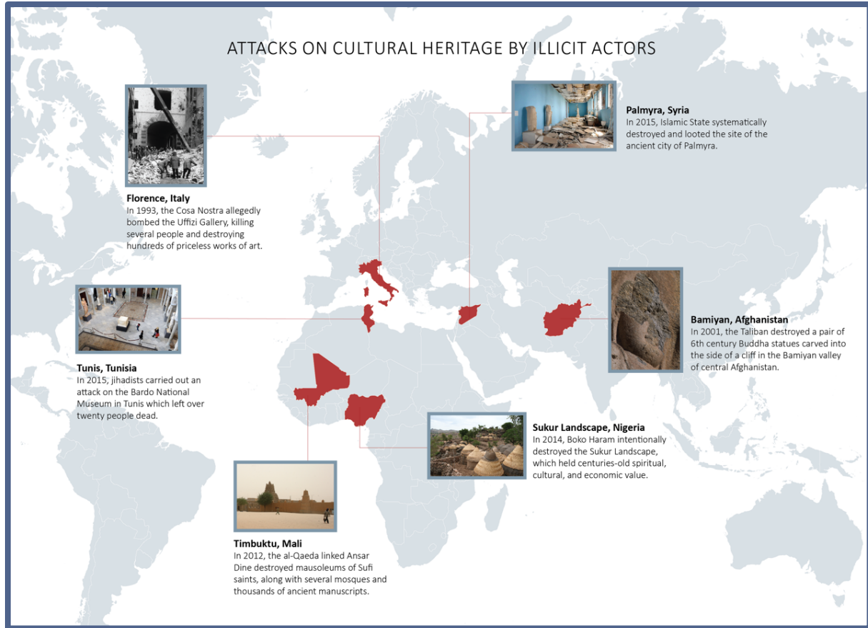
Figure 2: Examples of cultural heritage destruction by illicit actors.

The destruction of cultural heritage can also hinder post-conflict recovery and resiliency, including by reducing tourism revenue – a reality highlighted later in this Issue Brief. The loss can make it difficult to bind together a fragile society emerging from conflict, as in Ethiopia, for example. The damage to a community’s culture, including both tangible, such as physical buildings and artifacts, and intangible, such as traditions and living expressions inherited from ancestors, 45 can often be difficult to quantify, as the value is inestimable. This can make the erasure of a community’s collective identity at times an overlooked, and perhaps devalued, aspect of the threat. Yet, the destruction of cultural heritage generally occurs concurrently with other human rights abuses, including war crimes and crimes against humanity. Although scholars debate whether this destruction is a genocidal act and, notably, states have previously rejected the notion of “cultural genocide,” 46 it is – at a minimum – both a byproduct of and “a condition