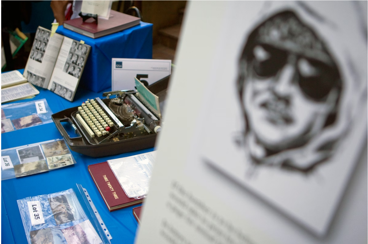
Personal property that once belonged to Mr. Kaczynski, also known as the Unabomber, are displayed for an online auction with proceeds to benefit victims' families in 2011.

When the package exploded, severely injuring the store owner, authorities circulated a flier nationwide depicting the suspect. Investigators speculated that the move spooked the Unabomber, causing him to lie low before resuming activities in 1993.