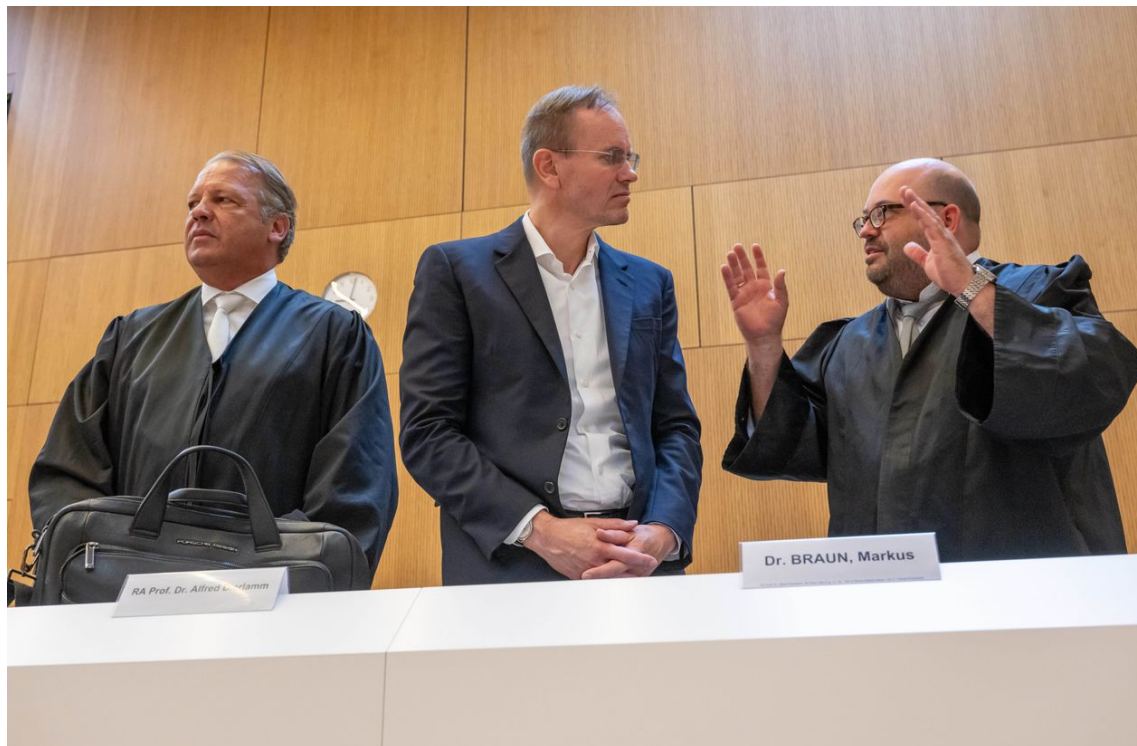
Former Wirecard CEO Markus Braun, middle, stands in court between his lawyers in the biggest fraud case in Germany's postwar history.

Prosecutors allege that billions of dollars in investors' funds were siphoned off through fictitious activities and overvalued transactions. Wirecard's CEO, Markus Braun was charged with defrauding investors and other crimes. He is currently being tried. He denies wrongdoing and has pleaded not guilty.