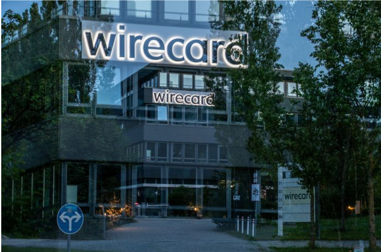
Wirecard headquarters in Aschheim near Munich.

A Russian government spokeswoman said allegations of links between Marsalek and Russia’s intelligence services were a “politicization.” Marsalek’s German lawyer didn’t respond to requests for comment.