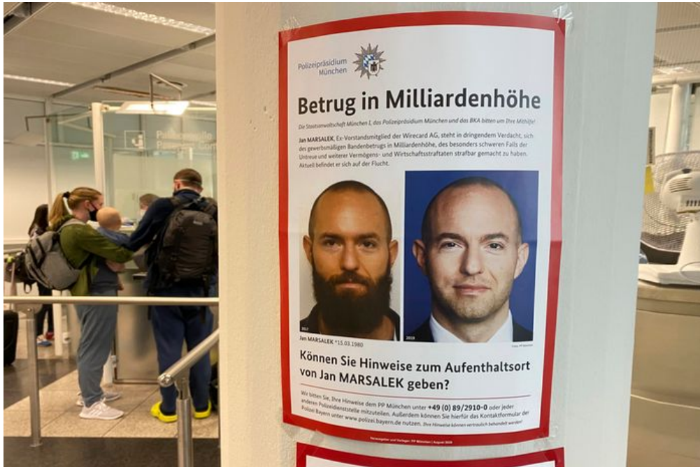
A wanted poster at a German airport.

Some officials suspect he was passing this data on to Russia. Marsalek, who was jetting around the globe as an executive, chose Russia as his most frequent destination, taking dozens of trips there in the years before he was forced to flee to Moscow, according to investigators and intelligence officials.